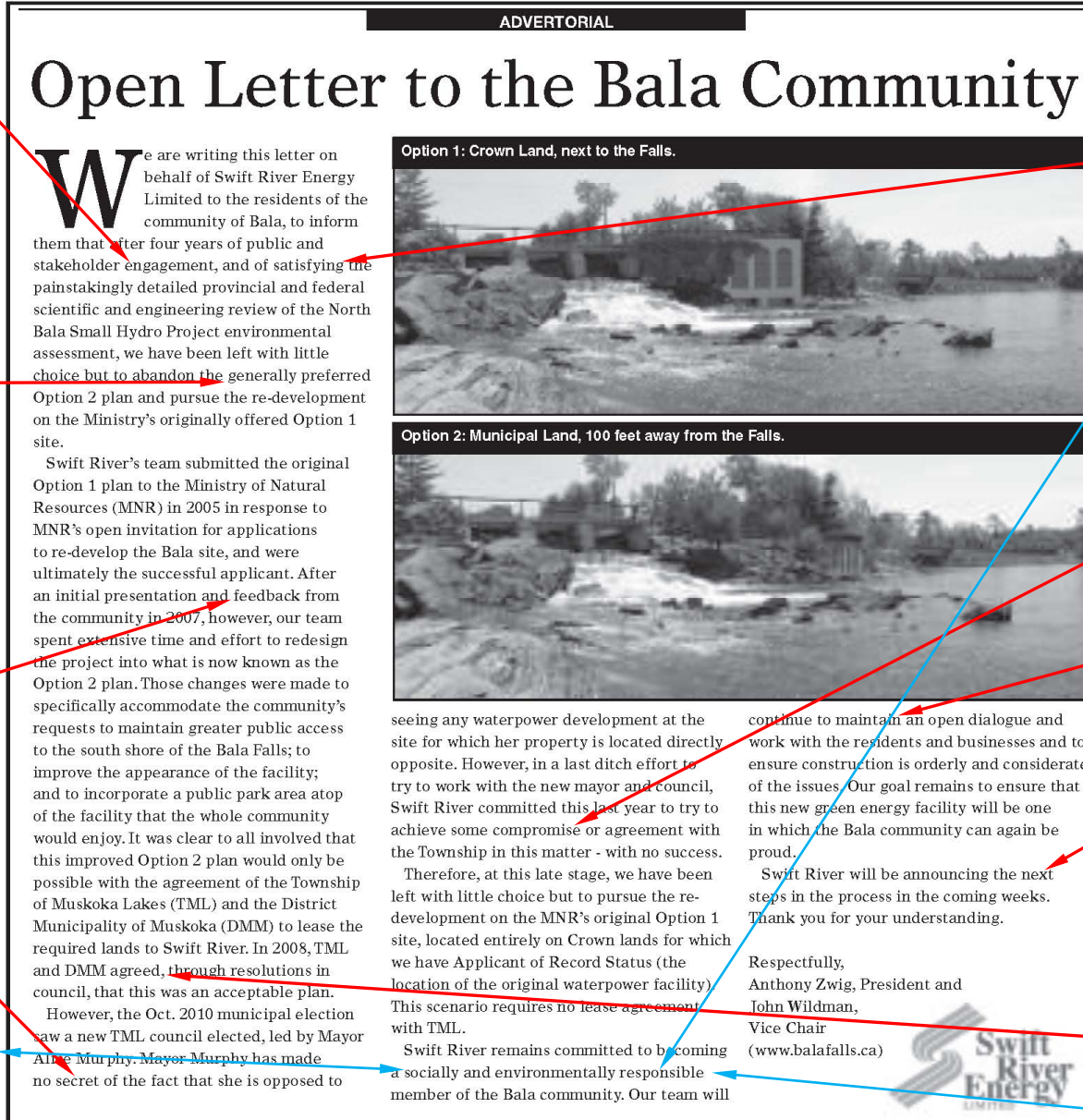
Option 1: Crown Land, next to the Falls.

Mayor Alice Murphy was very clear about her election platform and received 50% more votes than the COMBINED total of all the others running for Mayor. This is the democratic process. That the proponent resorts to personal attacks on our duly elected public officials is a serious concern.