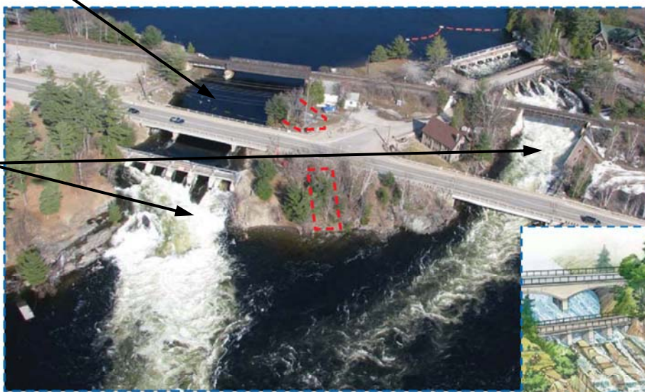
The Bala Falls area showing the location of our proposed Bala Falls Small Hydro Project.

It is worth noting that reports released by the West Muskoka Chamber of Commerce and the Muskoka Lakes Township identified a number of initiatives that would encourage and lengthen visits to the community. Many of these initiatives are part of our site development plan.