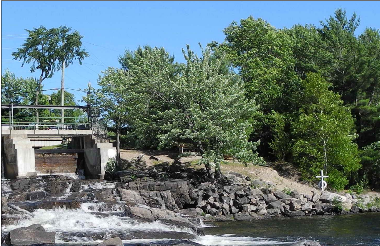
Proposed Hydro-electric Generating Station at the Bala Falls

Site should be protected until all approvals have been issued