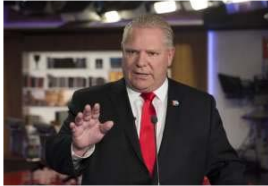
Ontario Conservative Party leadership candidate Doug Ford.

"This project stinks of political interests and insider deals," Ford said in a statement. "I want to know who is benefiting from this project and at what cost to local residents and the local environment."