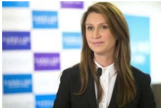
Ontario PC Leadership candidate Caroline Mulroney

Mulroney said she would establish an expert committee to develop a sexual harassment policy and a stronger vetting process for candidates, senior staff and party executive members.