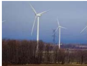
LAU: Ford needs to target high electricity costs