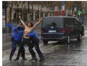
'FAKE PEACE MAKERS': Topless protesters attempt to disrupt Trump's motorcade

ASK AMY: Vaping dad places new baby at risk