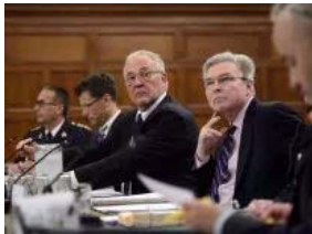
LEWY: Feds never really had a plan for irregular migrants