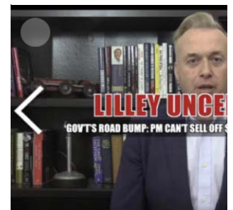
LILLEY UNCENSORED: Taxpayers from the feds