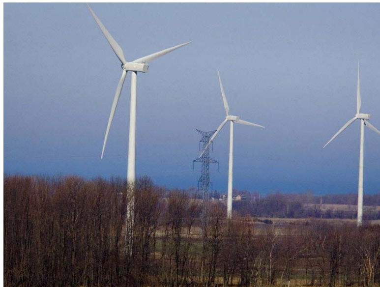
Wind turbines located north of Goderich on the shore of Lake Huron.

So far, Doug Ford has spent his time as Ontario premier busily curtailing the damage of some of the worst Liberal policies.