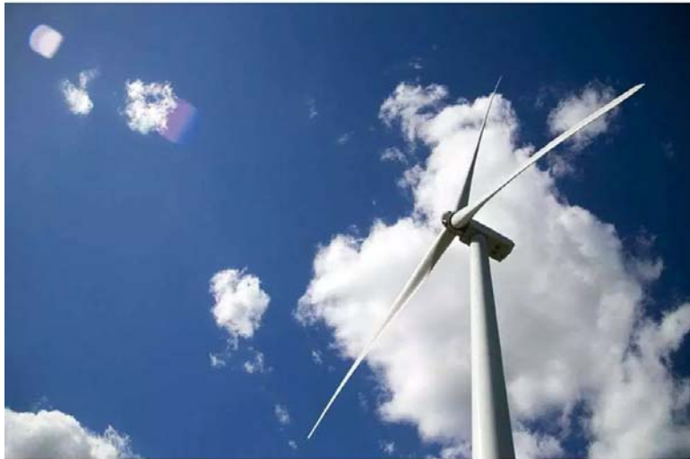
New wind turbine projects will be affected by the Ontario Liberal government cancelling their green energy act to save money. Photograph taken on Tuesday September 27, 2016 near Strathroy, Ont., west of London.